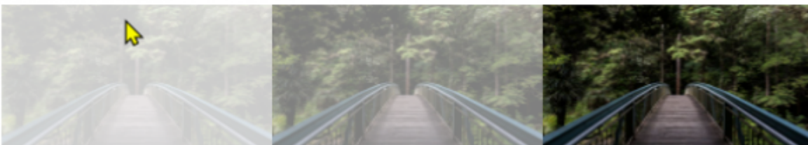
Image with 20% opacity: Image with 50% opacity: Image with 100% opacity:

The opacity property specifies the Transparency of an element. The lower the value, the more transparent: